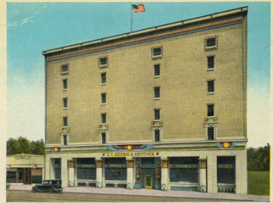
WAREHOUSES AND GENERAL OFFICES—2325-33 N. CLARK ST. 114346

Thank you for visiting us and taking the time to explore the history and architecture of our building. We hope you enjoy your journey through this remarkable piece of Chicago's heritage.